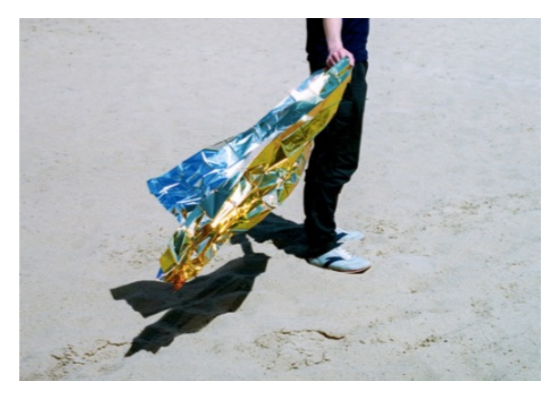
From Daring & Youth series, 2015–2018