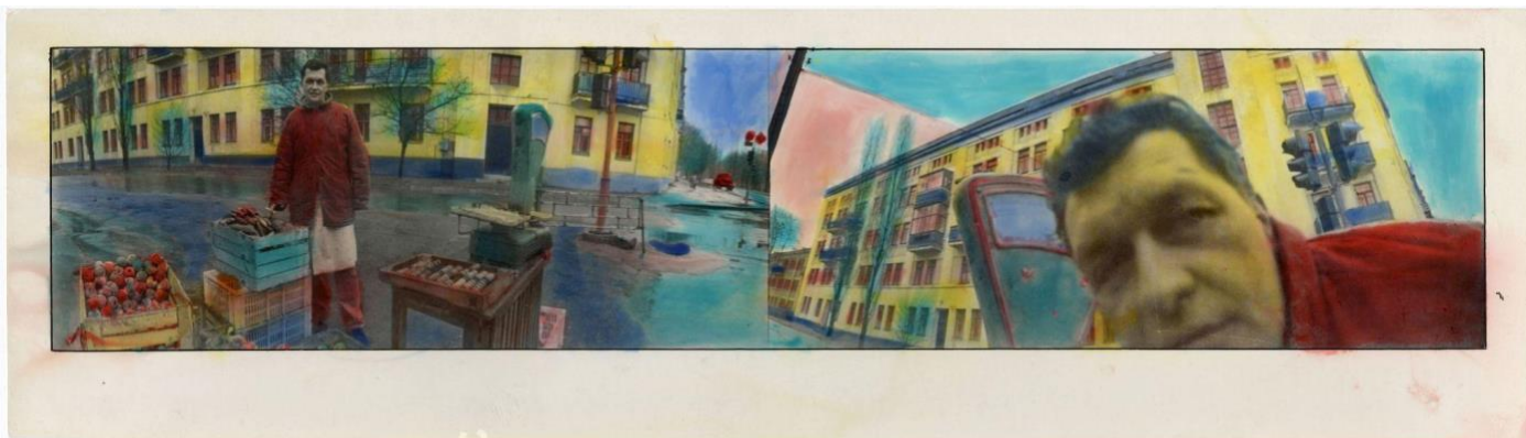
Trading rows, 1995, courtesy of artist and MOKSOP