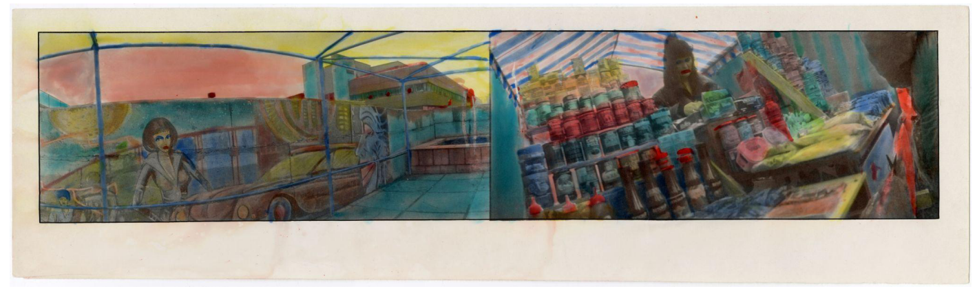
Retro. Trade in vegetables. Scales and abacus, 1993, courtesy of artist and MOKSOP