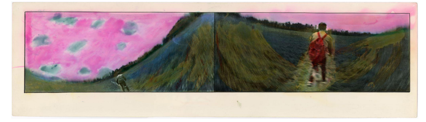
One with a backpack, 1995