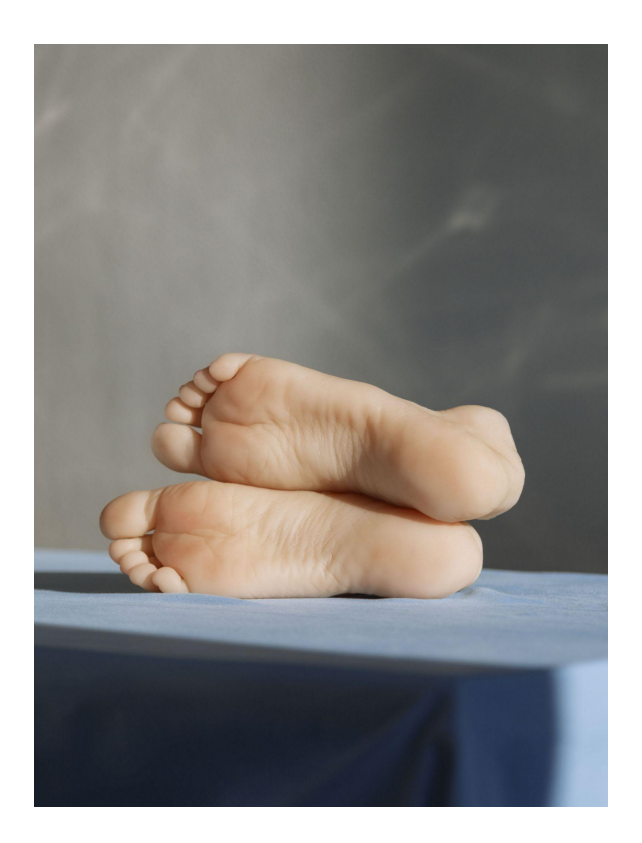
Foot #2, 2018 from Your next step would be the Transmission, 2018

I have been working on a project addressing social aspects such as human conformity, manipulation, pretence, and sincerity. These concepts surround us with varying intensity forming the cores of ideological movements, religious societies, and cults. The driving force behind this project was the activity of a UFO-centered Raëlian movement. The key pursuits of the movement are: raising funds for the construction of the embassy to return the aliens (who created people) to Earth, cloning people, the practice of Sensual Meditation, and provision of sex services by a separate unit of so-called Raël's Girls . In 2002, the society leader told the world that they managed to clone the first child, a girl named Eva. Unfortunately, her existence has not been proven. Today, according to various estimates, the total number of followers is about 300,000 people worldwide.