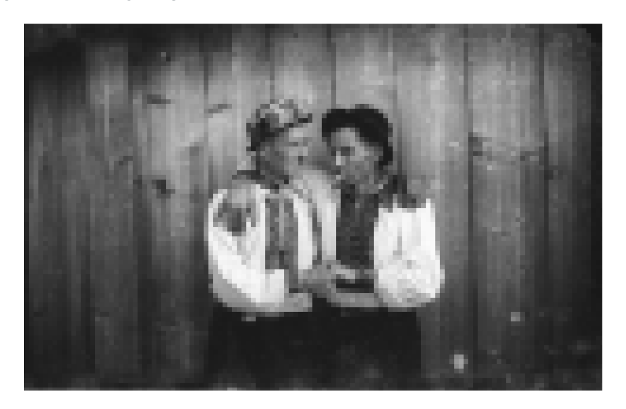
Untitled, year unknown