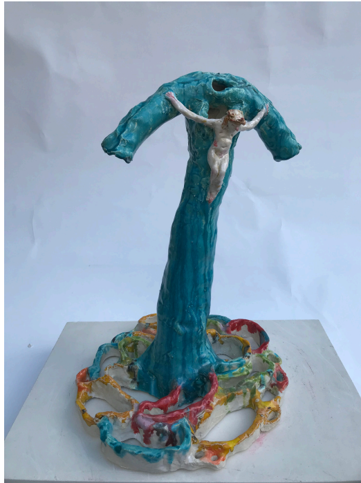
Easter, 2014 Glazed ceramic, 53 x 40 x 38 cm