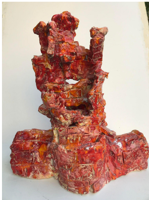
Buste, 2014 Glazed ceramic, 39 x 36 x 18 cm